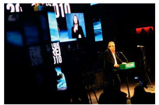
Presidential Candidate Sen. Eduardo Frei addressed supporters at Santiago's Teatro Caupolican on Wednesday night.

(June 18, 2009) With images of Chile's 20 last years as a democracy flashing on the screen behind him, presidential contender Sen. Eduardo Frei promised Wednesday night the "next transition" in the country's politics — a new constitution and a proactive government to take control of a free market gone wrong.